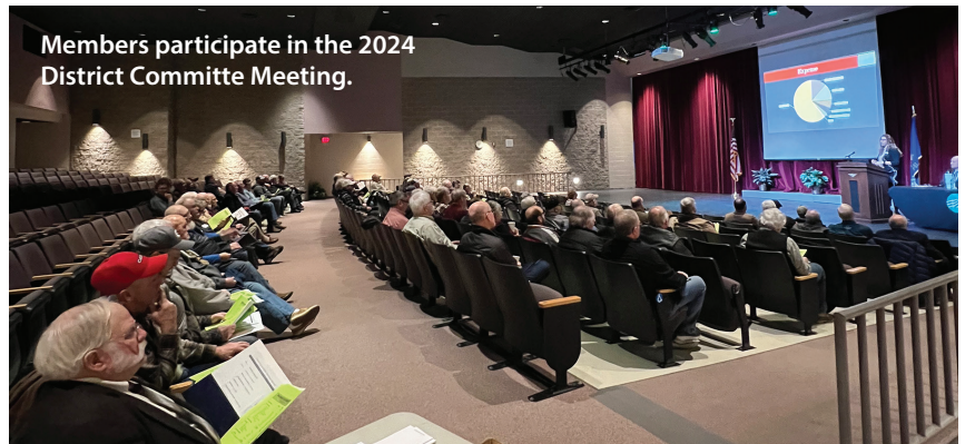
Members participate in the 2024 District Committee Meeting.

Members are elected as district committeepersons through