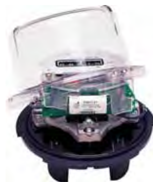
Automated Meter Reading Device

Reliability, efficiency, and community service are essential today as it was in 1937. For 75 years, Riverland Energy Cooperative demonstrated that no matter what the challenge, the cooperative has remained focused on its mission to deliver safe and reliable energy at a competitive price. Electricity brought with it a better life and economic opportunity for the region, and the cooperative spirit of the membership.