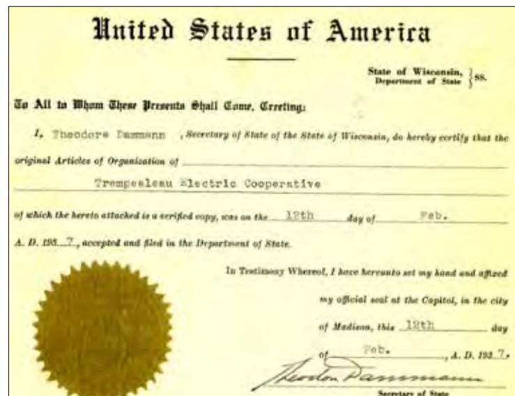
Articles of Incorporation