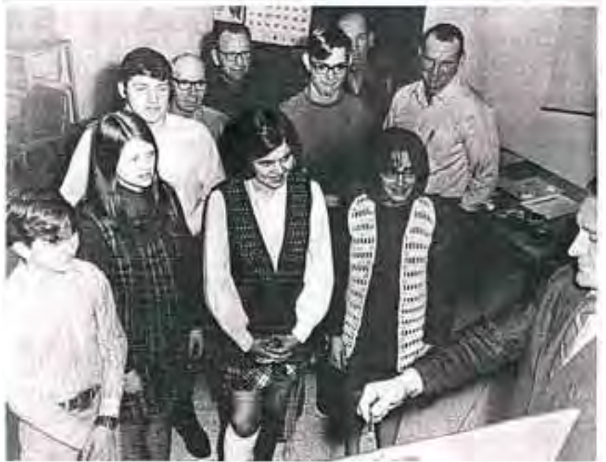
Buffalo Electric Cooperative Junior Board, 1970

Buffalo Electric Cooperative began its junior board in 1969.