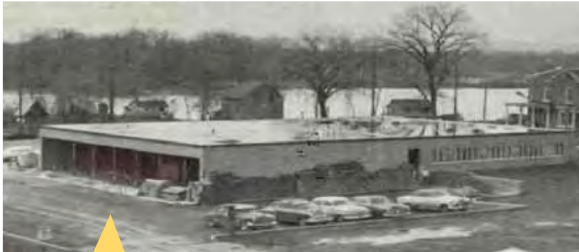
BEC Headquarters under construction, 1958

In 1958 a new office was built on Main Street in Alma.