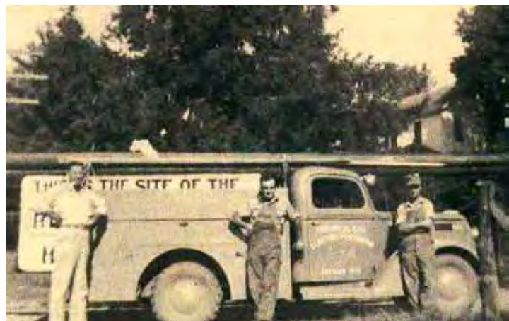
Unidentified employees in front of the original line truck