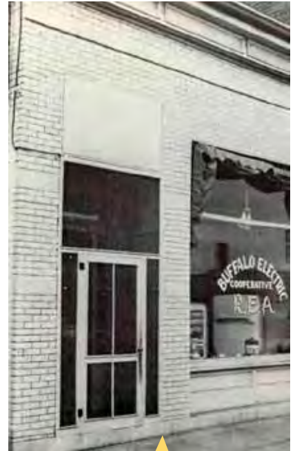
BEC Headquarters from 1939-1958

The Buffalo Electric Cooperative Headquarters was built in 1958 on Main Street in Alma