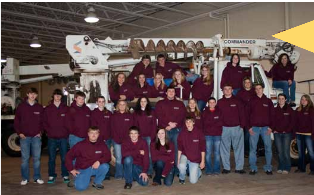
2011 Youth Ambassadors