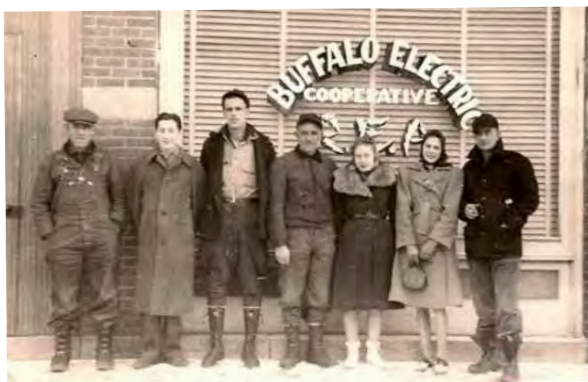
The first employees stand in front of the Buffalo Electric office in 1941.