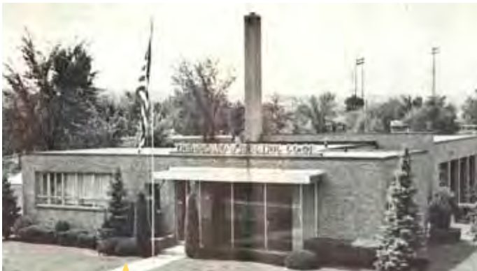
A new headquarters was built in 1948 on Main Street, Arcadia.