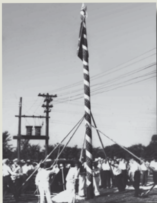
The first REA-financed power line pole in Wisconsin was erected at Richland Electric Cooperative on Sept. 7, 1936.